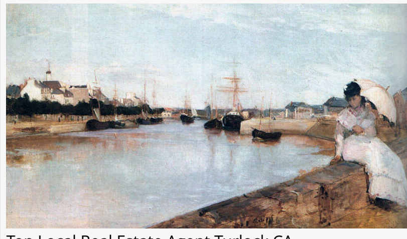
Top Local Real Estate Agent Turlock CA

Discover a real estate agent that complements your style. If your recommended technique of communication is e-mail, do not select