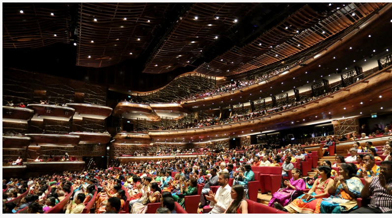
Packed auditorium of the Dubai Opera enjoys the tunes of healing

According to Sri Swamiji, the benefits of music therapy are many including relief from pain and discomfort, reduction of stress, improved coping, strengthened immune system, selfempowerment during treatment, strengthened family bonds, continued developmental growth, improved patient and family satisfaction and spiritual advancement. In addition, Sri Swamiji's healing music is utilized in large hospitals to accelerate the postoperative recovery and in intensive care units. Preliminary experiments to study the influence of Sri Swamiji's music on State police personnel showed an improved behavior with plaintiffs, reduced job stress and improved sense of well-being. When Sri Swamiji's music was played in prisons, an improvement in convicts' behavior with co-habitants and better social consciousness was observed. Sri Swamiji's music is used by the Department of Psychiatry, University of Arkansas for Medical Sciences to improve the mental health of patients.