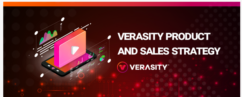
Veracity Product and Sales Strategy