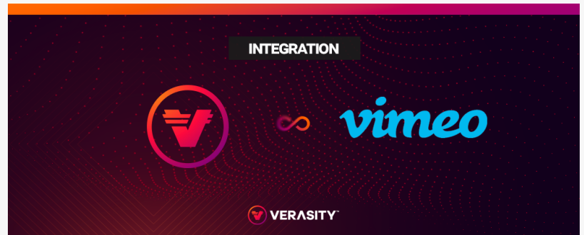
Veracity Integrates with Vimeo