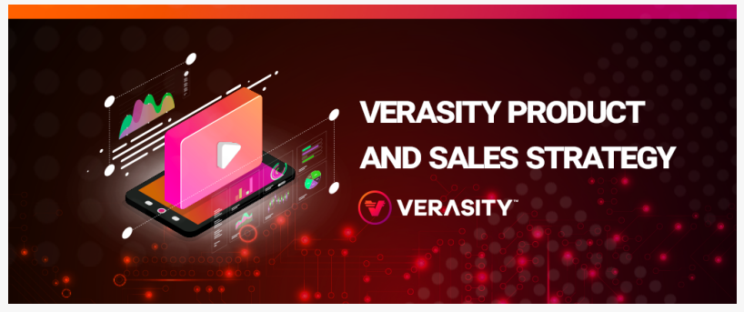
Verasity Product and Sales Strategy

By adding the Verasity Video Reward module, content creators will be able to use VRA to reach, reward and retain their viewers. This means that content creators will get loyalty and new revenue while viewers get rewarded for their attention. This attention-based model creates a thriving VRA token economy!