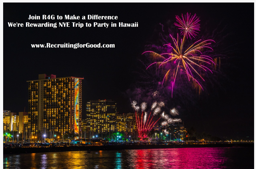
Fun for Couples & Families to Party for Good