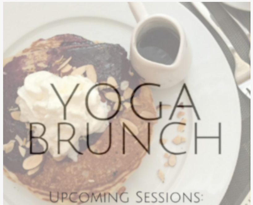
Bosscat Partners with Local Social Benefit Events & Community like Yoga Brunch Llife

This press release can be viewed online at: http://www.einpresswire.com