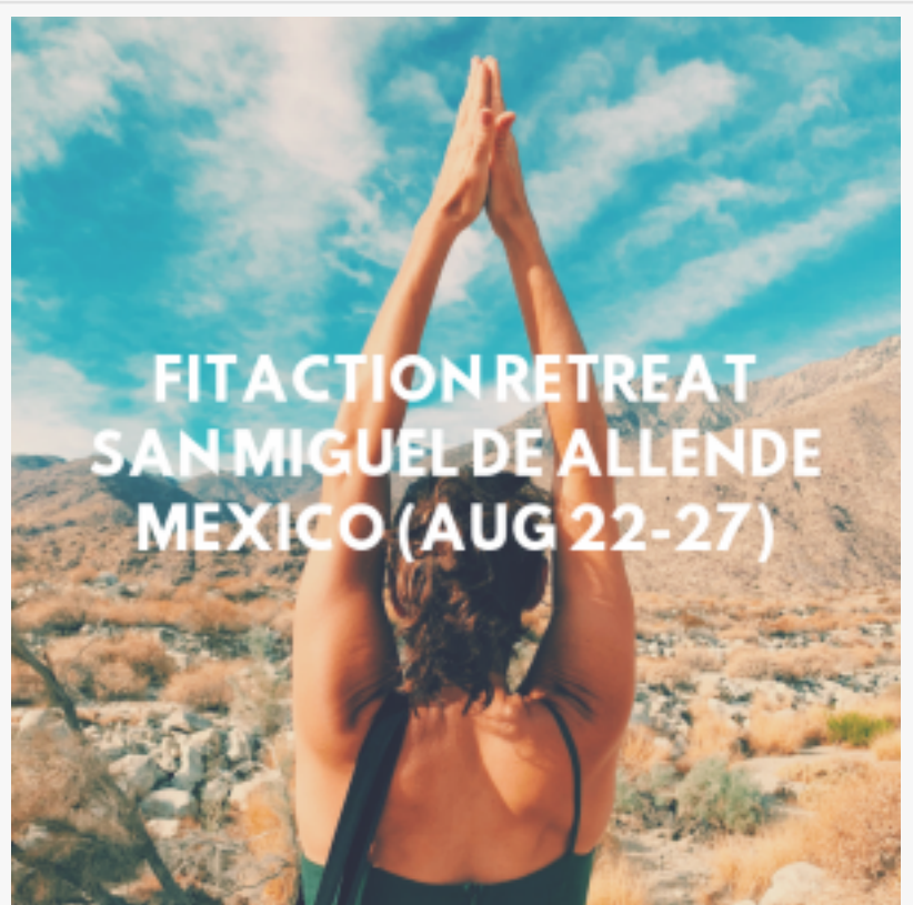
Bosscat Supports Travel Impact Partnerships Like These

Bosscat Productions Bosscat Productions +1 3232058687 email us here