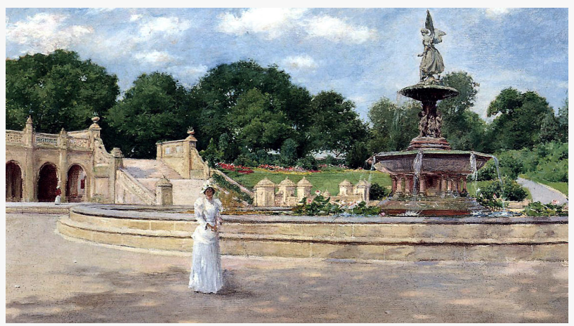
Top Local Real Estate Agent Sharpburg GA

Why use a top real estate agent to market your house? A house is generally the biggest investment that a person makes in a life time. When it comes time for you to offer your residence the bottom line is this. Am I obtaining the best sales price for my house? https://real-estate-agents-realtors-sharpsburg-ga.business.site