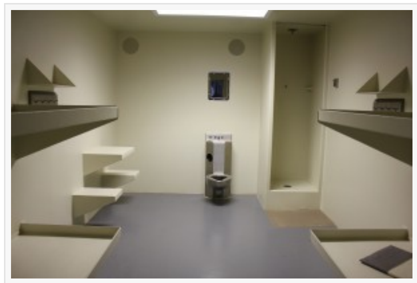
4 Modular Steel Cell

Re: SteelCell of North America Inc.,"The Detention Industry's Recognized Leader In Prefabricated Products" 1-2-4 Man Jail and Prison Cells, (Minimum to Supermax Classification Units) / Custom modular Police