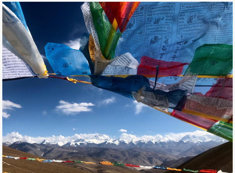
Buddhist Prayer Flags on Base Camp