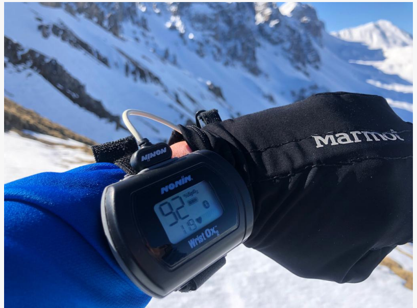
Continuous SPO2. Safety in adventure has seen a game-changer with this technology

LAKE TAHOE, NV, UNITED STATES, April 30, 2019 /EINPresswire.com/ -- As climbers head to the top of the world on Mount Everest, WiCis is keeping them safer and extending the reach and effectiveness of TeleHealth. The company is once again proving their wearable technology platform that is continuously monitoring and sharing a climbers' vital signs and location with medical teams, rescue personnel and loved ones within seconds of being collected. May is summit month for Everest, and the challenge this year is to achieve the summit with the highest success rate while never compromising the safety of the climbers. With high oxygen flows and the most modern monitoring methods coming direct from critical care medicine, Furtenbach Adventures and WiCis seek to ensure base-camp oxygen saturations throughout the entire climb, thus never reaching the triggers that cause HAPE (High Altitude Pulmonary Edema) and HACE (High Altitude Cerebral edema) while on the mountain.