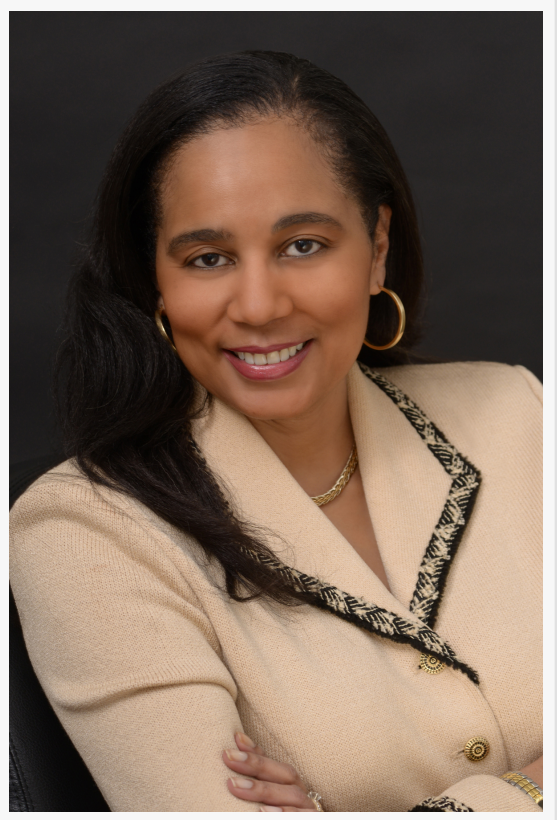
President and CEO of NAMIC

NAMIC (National Association for Multi-ethnicity in Communications) is the premier organization focusing on cultural diversity, equity and inclusion in the communications industry. More than 4,000 professionals belong to a network of 18 chapters nationwide. Through