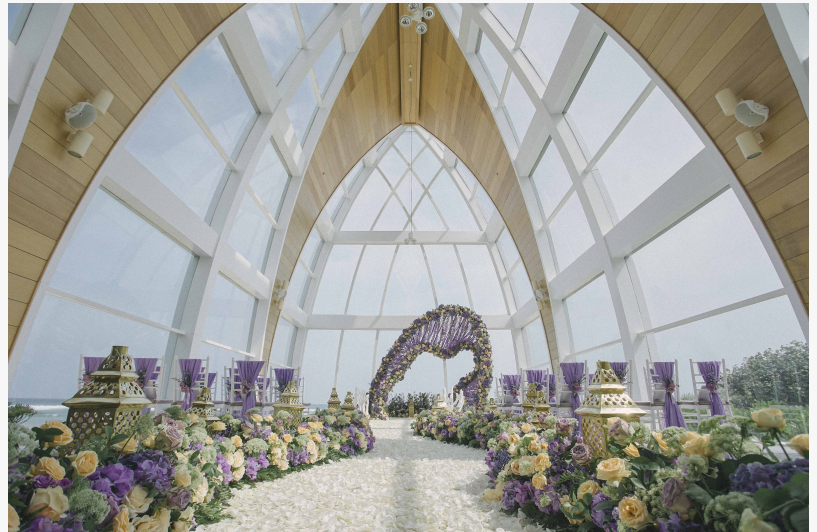
The Majestic Chapel