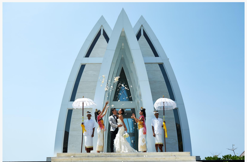
Make Your Dream Wedding Come True