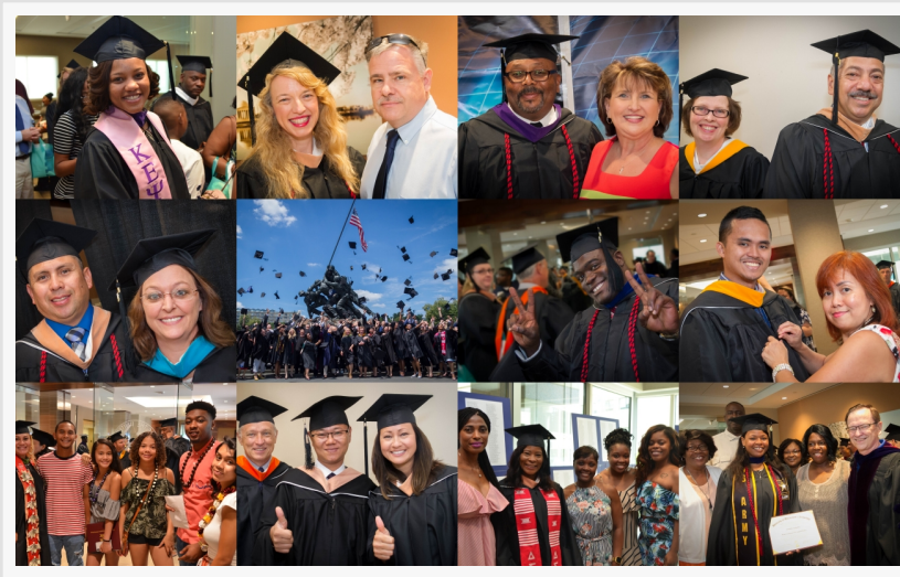
2018 UMT Graduates

The University of Management and Technology is an accredited university located in Arlington VA. Since 1998, UMT has built a strong global higher learning community through its online and distance education. Geographical boundaries do not limit UMT and its students who reside in 50 states, the District of Columbia, 4 US territories of the United States, and 78 countries worldwide. As of March 2019, UMT has provided various levels of education