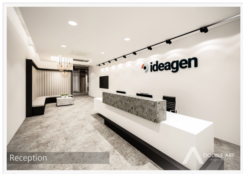
Ideagen Reception KL

The ambitious project will see 70 new jobs created in the first phase of recruitment, with roles ranging from software development, test and cyber security among the vacancies.