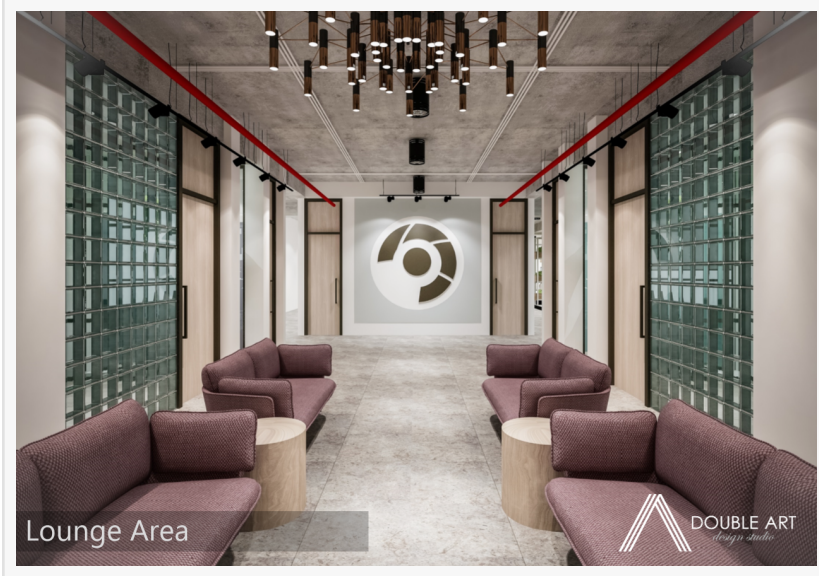
Lounge Area KL