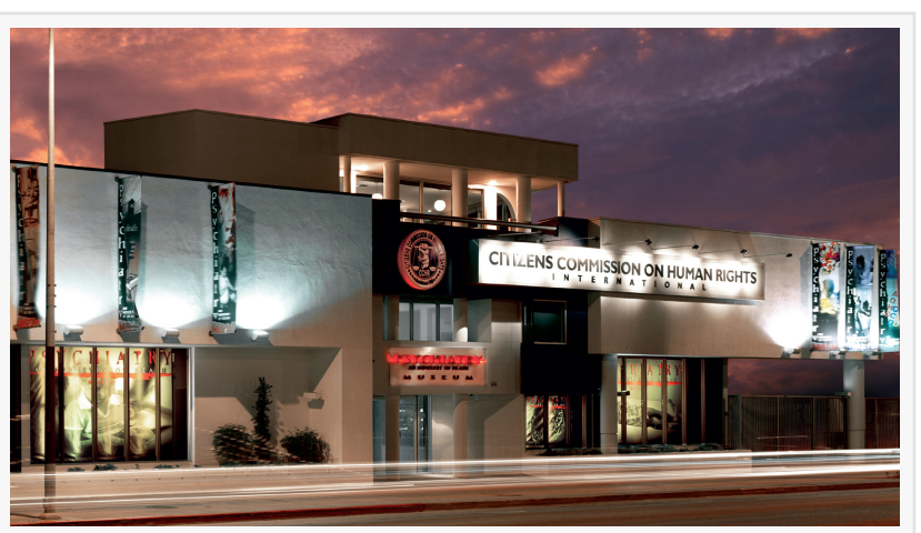
CCHR's mission is to eradicate abuses committed under the guise of mental health and enact patient and consumer protections.