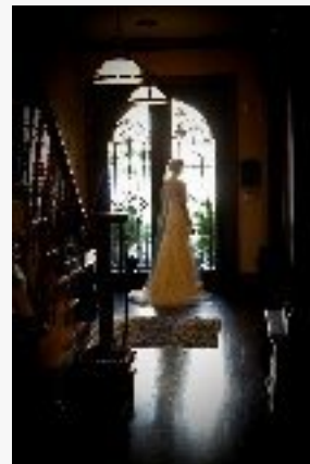
Villa D'Citta Bed & Breakfast