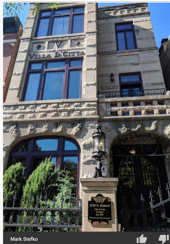
Villa D'Citta Bed & Breakfast

This press release can be viewed online at: http://www.einpresswire.com