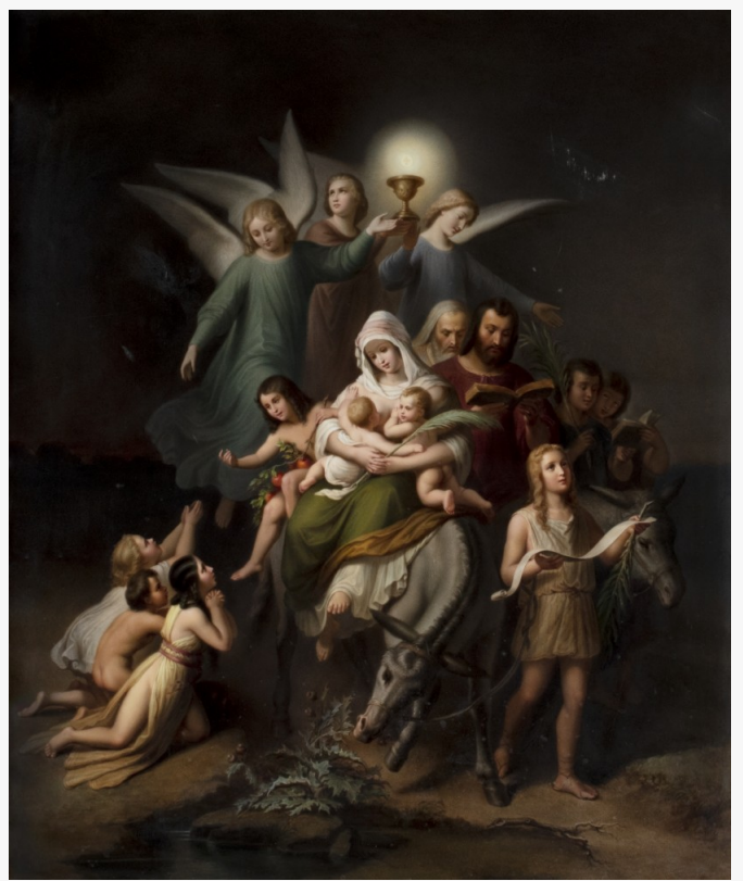
Large, late 19th century Berlin K.P.M. porcelain plaque titled The Flight into Egypt, 36 ½ inches by 32 ½ inches (framed), from the estate of the late actor Peter Falk (est. $10,000-$15,000).