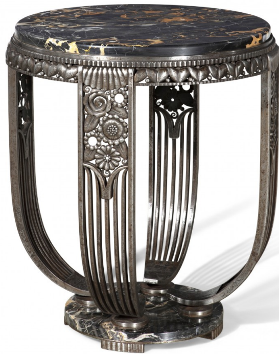
Edgar Brandt silvered wrought iron and portor marble center table, circa 1925, impressed "E. BRANDT", 27 inches tall, 23 inches in diameter (est. $20,000-$30,000).