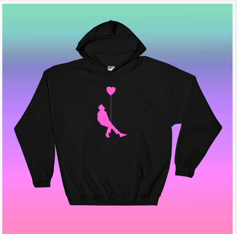
Lonely Lover Hoodie