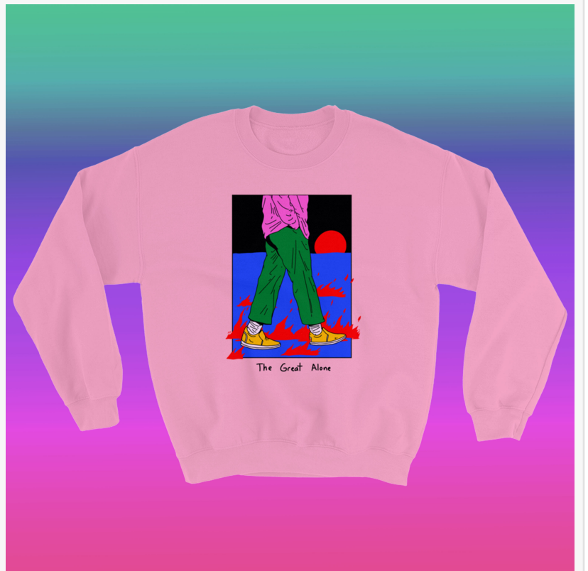
Great Alone Crewneck - Pink

This press release can be viewed online at: http://www.einpresswire.com