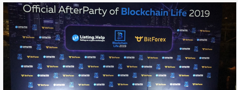
Official AfterParty of Blockchain Life 2019