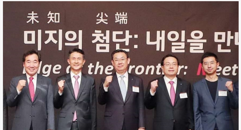
Among the attendants was Lee Nak-yeon, current Prime Minister of South Korea, a man slated to become the next president of the country.