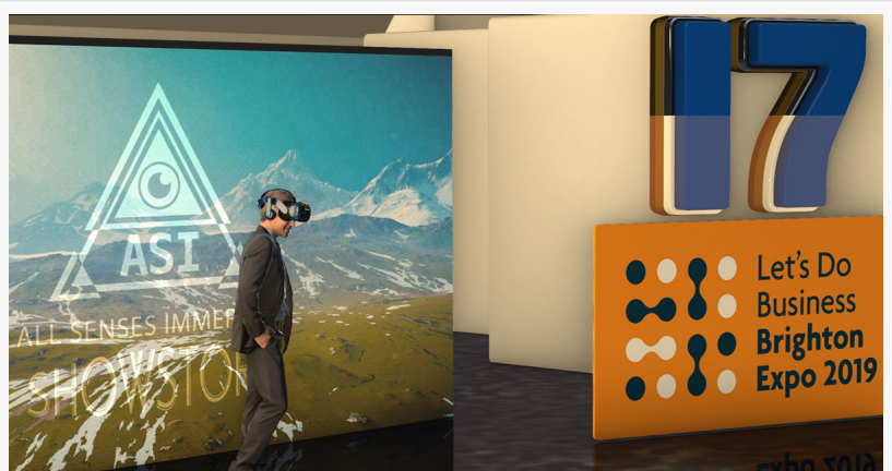
How Big Is Your World? ASI at Brighton Expo 2019

101' - Everything Your Business Needs to Know & How to Take an Unfair Advantage Over Your Competition'