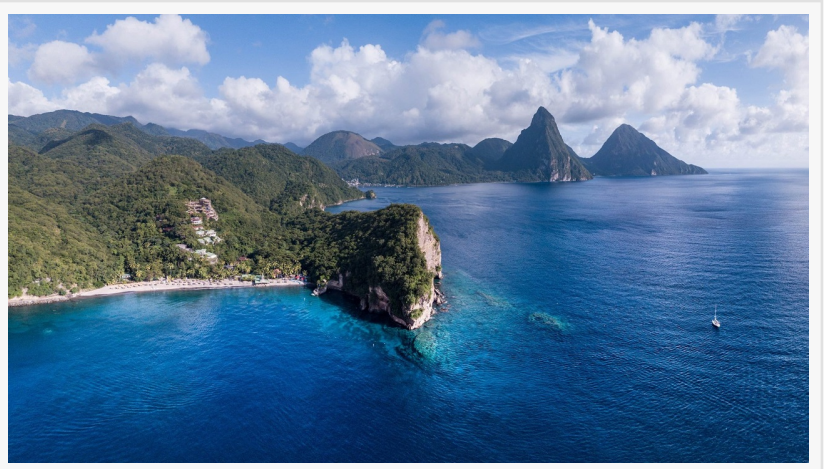
Anse Chastanet is set amid a lush 600-acre estate with two soft-sand beaches and breathtaking views of St. Lucia's twin Pitons mountains.