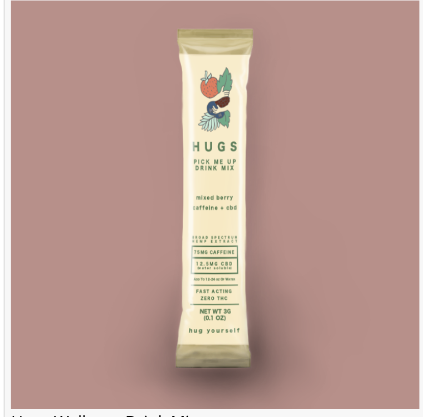
Hugs Wellness Drink Mix

This press release can be viewed online at: http://www.einpresswire.com Disclaimer: If you have any questions regarding information in this press release please contact