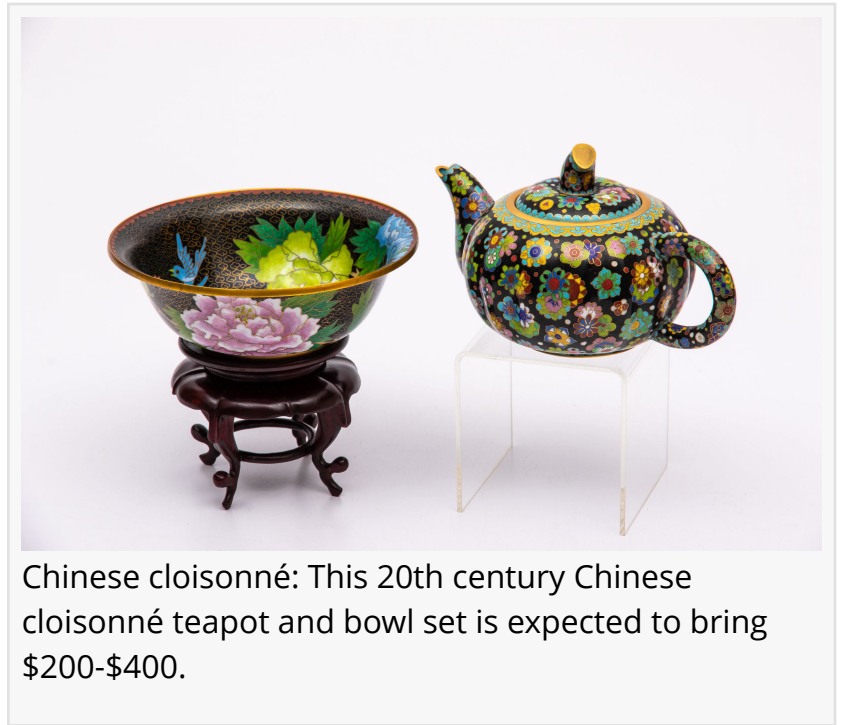
Chinese cloisonné: This 20th century Chinese cloisonné teapot and bowl set is expected to bring $200-$400.

Gray's Auctioneers & Appraisers is always accepting quality consignments for future auctions. To inquire about selling a single piece, an estate or an entire collection, you may call them at (216) 226-3300; or, you can send an e-mail to their appraisals department, at appraisals@graysauctioneers.com .