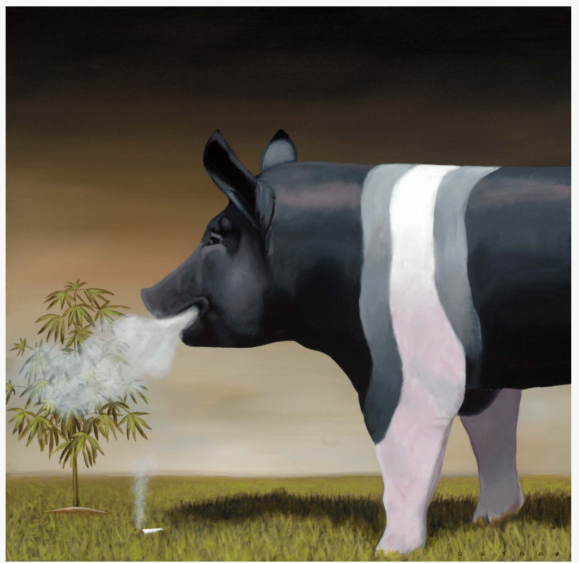
Robert Deyber, High on the Hog, Hand Signed Lithograph, 2009, 9.5 x 9 inches

The cultural revolution of the 1960s birthed a unique marriage of marijuana and artists. While cannabis has been a muse of the art world and those who create in all mediums for decades, Deyber's clever spin with words and images stands distinctly on its own. Deyber's 'phrases as images' move the viewer in and out of visual themes and storylines; his colors and light are often contrasted against the landscape and scenery of the legendary artist's surroundings. Deyber delights in creating amusing visual homages to nature, animals and his sub-conscious. His paintings are, at the same time, inviting and intriguing. http://bit.ly/ Robert Deyber Cannabis