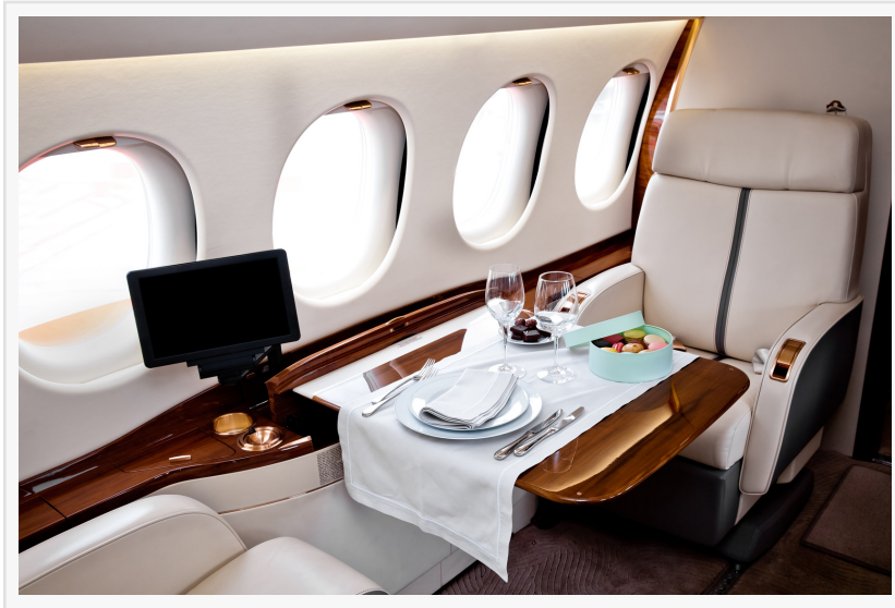
Delta World Charter - inside one of our Jets

The time and hustle saving that can be realized when flying private are