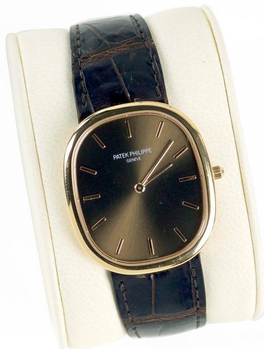
Patek Philippe Ellipse model watch with an 18kt rose gold cushion shape case, a brown dial with rose gold baton time markers and a brown alligator bracelet (each est. $4,000-$6,000).