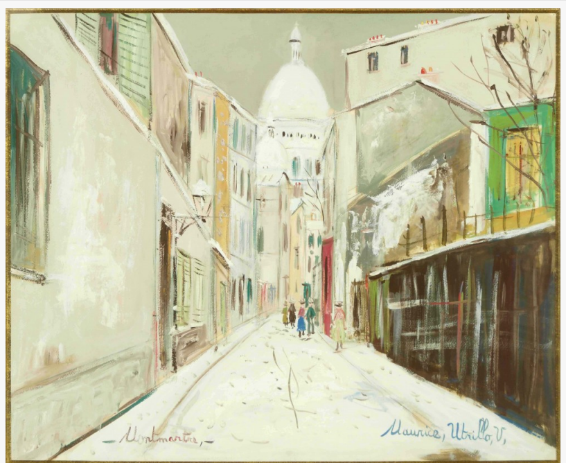
Original gouache painting by Maurice Utrillo (French, 1883-1955), titled Rue de Mont-Cenis a Montmartre, signed lower right, with provenance dating to 1963 (est. $50,000-$70,000).

Other Patek Philippe watches will include a men's Ellipse model with an 18kt rose gold cushion shape case; and an 18kt yellow gold lady's Ellipse watch with quartz movement and blue enamel