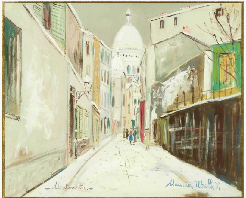
Original gouache painting by Maurice Utrillo (French, 1883-1955), titled Rue de Mont-Cenis a Montmartre, signed lower right, with provenance dating to 1963 (est. $50,000-$70,000).

The diamond and platinum engagement ring set, and the Patek Philippe watch, are the probable superstars of Day 1. The diamond in the ring set boasts J color and VVS-1 clarity. The four bezel set baguette diamonds surrounding the central diamond have G-H color and VS-1/VS-2 clarity. The platinum band contains nine baguette diamonds. The set is estimated at $15,000-$20,000.