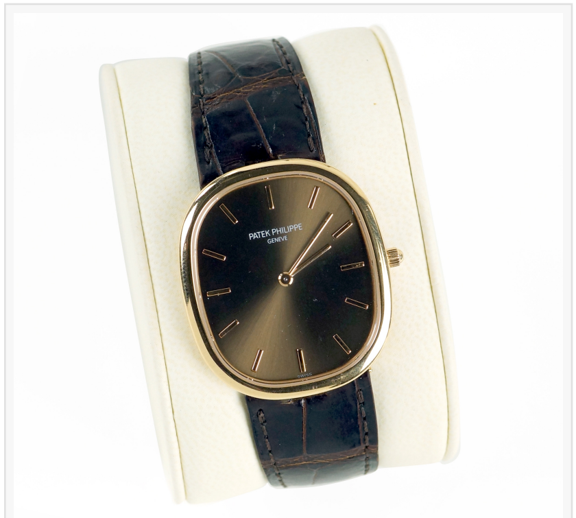
Patek Philippe Ellipse model watch with an 18kt rose gold cushion shape case, a brown dial with rose gold baton time markers and a brown alligator bracelet (each est. $4,000-$6,000).

Max Condon Susanin's Auctions +1 312-832-9035 email us here