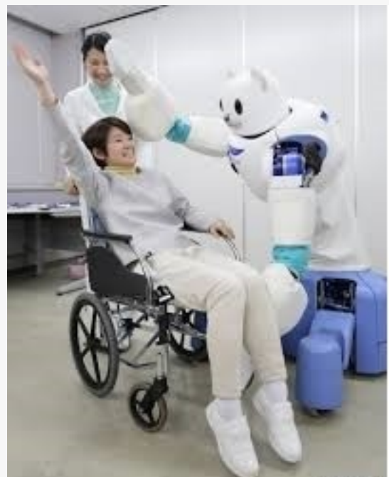
How robotics help