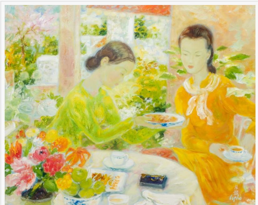
LE PHO, French/Vietnamese (1907-2001), 'Le Thé' (Tea Time), oil on canvas, signed, 32 x 39 1/2 inches, Estimate $40,000-60,000 Sold for US$100,000