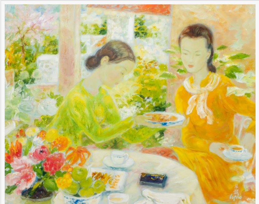
LE PHO, French/Vietnamese (1907-2001), 'Le Thé' (Tea Time), oil on canvas, signed, 32 x 39 1/2 inches, Estimate $40,000-60,000 Sold for US$100,000

Shannon's kept their momentum for international art throughout the sale. A bronze Disco by Contemporary Italian artist Arnaldo Pomodoro doubled its high estimate selling for $40,000.