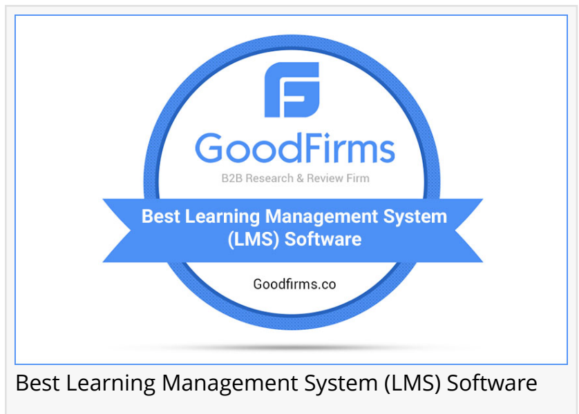
Best Learning Management System (LMS) Software

WASHINGTON, DC, UNITED STATES, May 13, 2019 /EINPresswire.com/ -- GoodFirms unveiled the list of Best Learning Management System (LMS) Software that is popular for providing super-efficient cloud-based learning systems. In this digitalised world, most of the schools, universities, organisations, businesses, etc. have started adopting the LMS Software. This software has made effortless and easy method for sharing the study material, giving online training to new joiners, selling other courses to learn and many more.