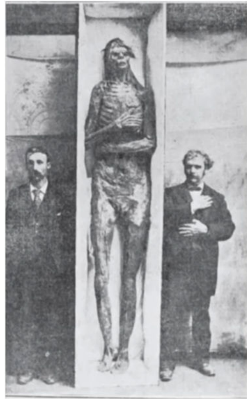
Picture of Giant Skeleton Found in Lovelock Cave

This press release can be viewed online at: http://www.einpresswire.com