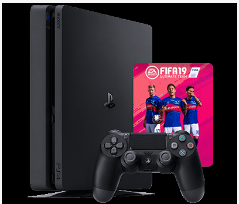
PlayStation 4 500 GB Console With FIFA 19 And Extra DualShock 4 Controller

With the increasing demand for top-notch products, the need to bring in products that are liked by the majority of the shoppers shopping online has become a painstaking task for online e-commerce businesses. Asaan, on the other hand, brings a solution to this by offering shoppers curated products handpicked by thousands of other online shoppers that have previously purchased that product. This way product buying becomes easy and users can shop from others' recommendation and share ideas based on what they like online.