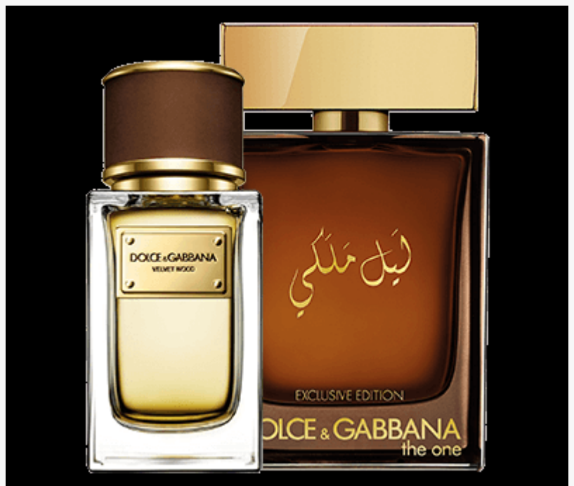
Buy Best Fragrance