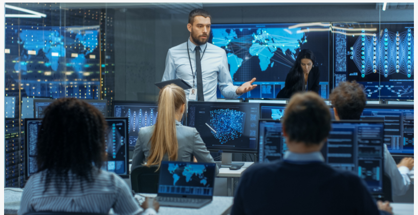
Emerging laboratory heads need to be equipped to lead these teams for innovation by learning to harness this diversity