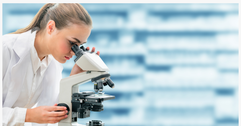
Leadership education will help with research

Registration for the Management & Leadership Skills for Science-Based Professionals program