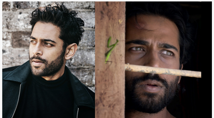
Australian born Indian actor in The Lone Wolf