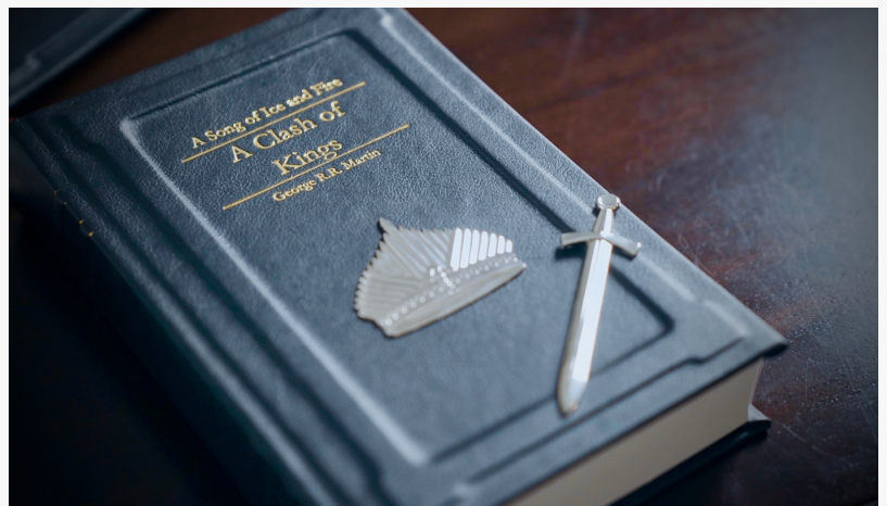
Book cover with removable bookmark