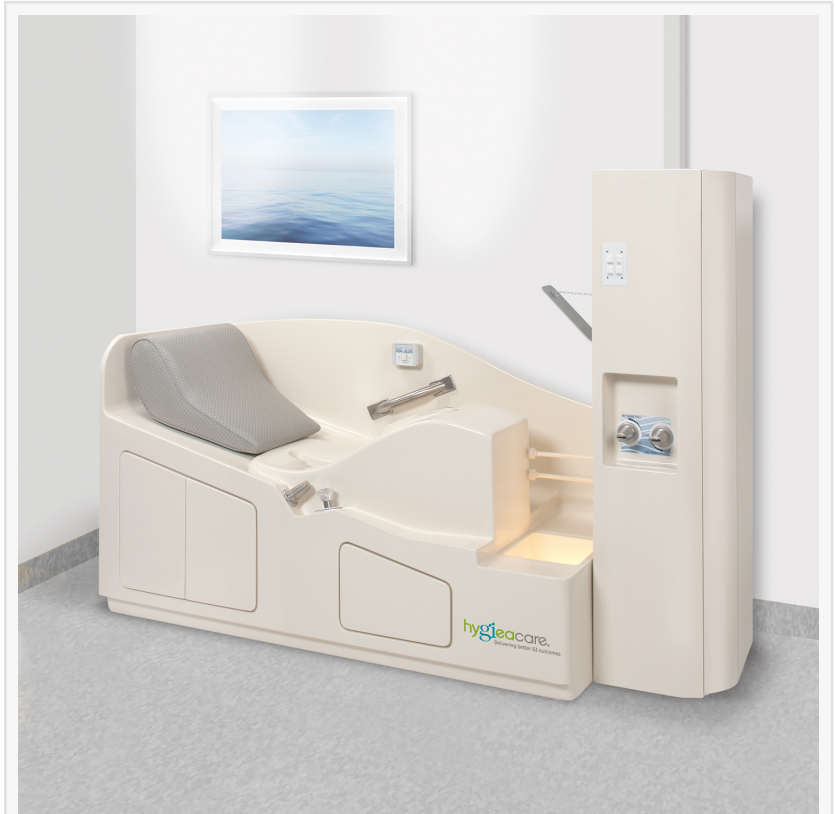
HyGleaCare patient experience is outstanding