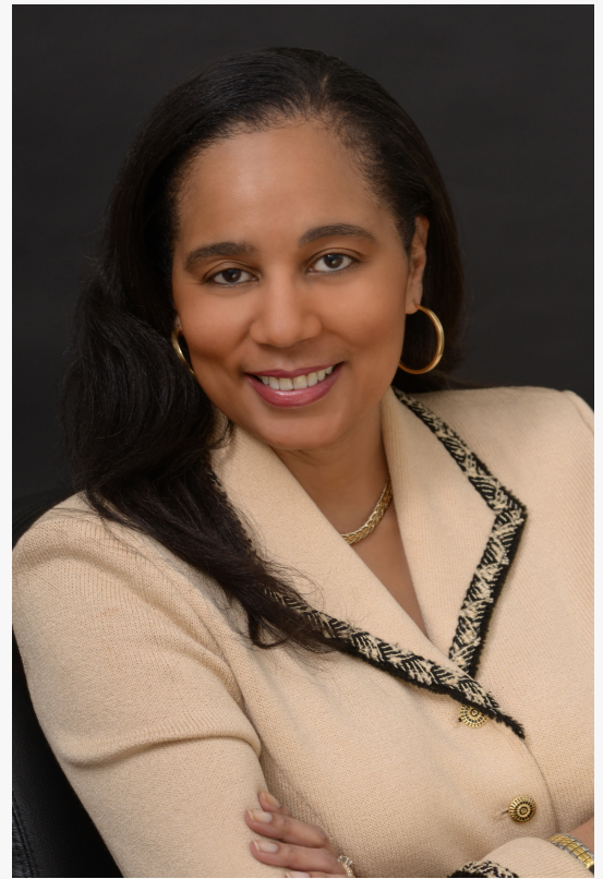
President and CEO of NAMIC

NAMIC (National Association for Multi-ethnicity in Communications) is the premier organization focusing on cultural diversity, equity and inclusion in the communications industry. More than 4,000 professionals belong to a network of 18 chapters nationwide. Through initiatives that target leadership development, advocacy and empowerment, NAMIC collaborates with industry partners to expand and nurture a workforce that reflects the cultural richness of the populations served. Please visit www.namic.com or follow @NAMICNational on Twitter for more information about NAMIC and its many opportunities.