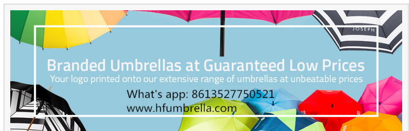
custom umbrellas China

Huifeng is changing the narrative by involving customers from the word go. Brands can get in touch with the manufacturer and state their design, materials and marketing needs. The umbrella maker then gets into action to produce prototypes, keeping the client on the loop every step of the way. Once approved, final umbrellas that excel in finesse are manufactured to the client's specifications.