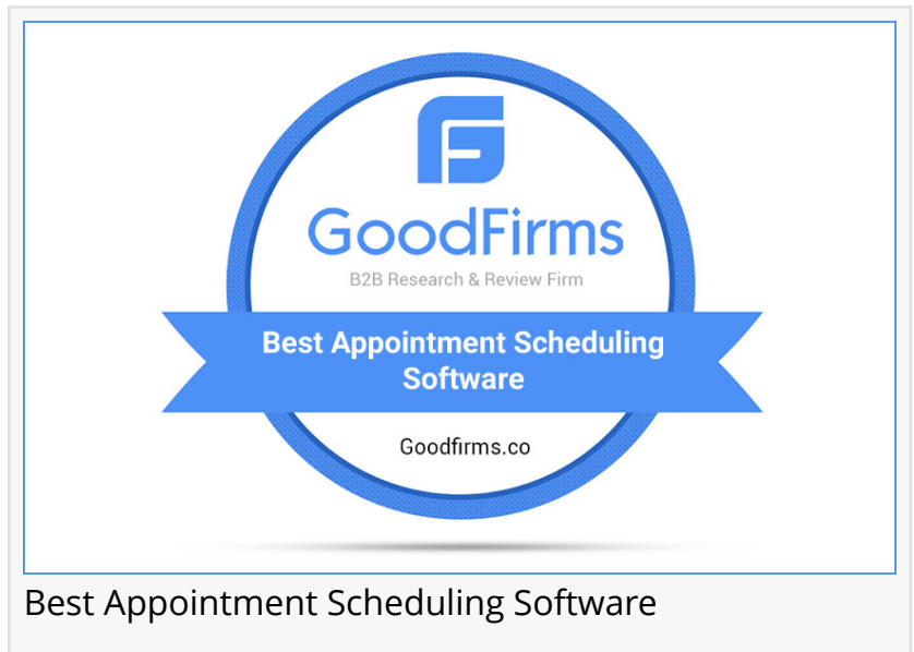
Best Appointment Scheduling Software

It has become strenuous these days to choose the right tool, as there are many vendors out there claiming their products are outstanding and creating a dilemma for the customers. Thus, to guide in picking the most excellent software for your business, GoodFirms revealed the Best Appointment Scheduling Software providers based on several qualitative and quantitative measures.