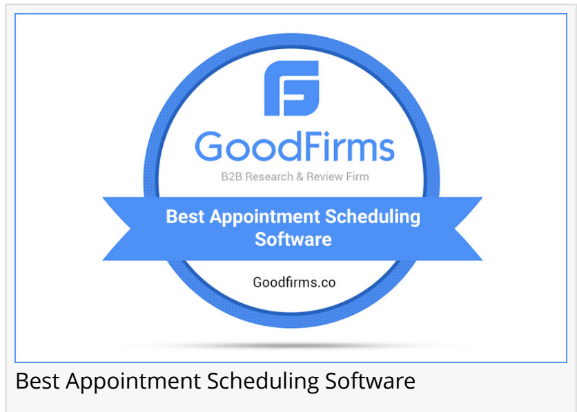
Best Appointment Scheduling Software

It has become strenuous these days to choose the right tool, as there are many vendors out there claiming their products are outstanding and creating a dilemma for the customers. Thus, to guide in picking the most excellent software for your business, GoodFirms revealed the Best Appointment Scheduling Software providers based on several qualitative and quantitative measures.