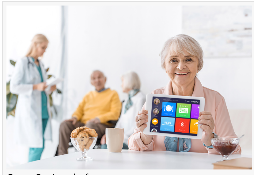
Oscar Senior platform

Oscar Senior is a fully customizable platform that helps care organizations enhance their quality of care, reduce costs and improve efficiency. This is