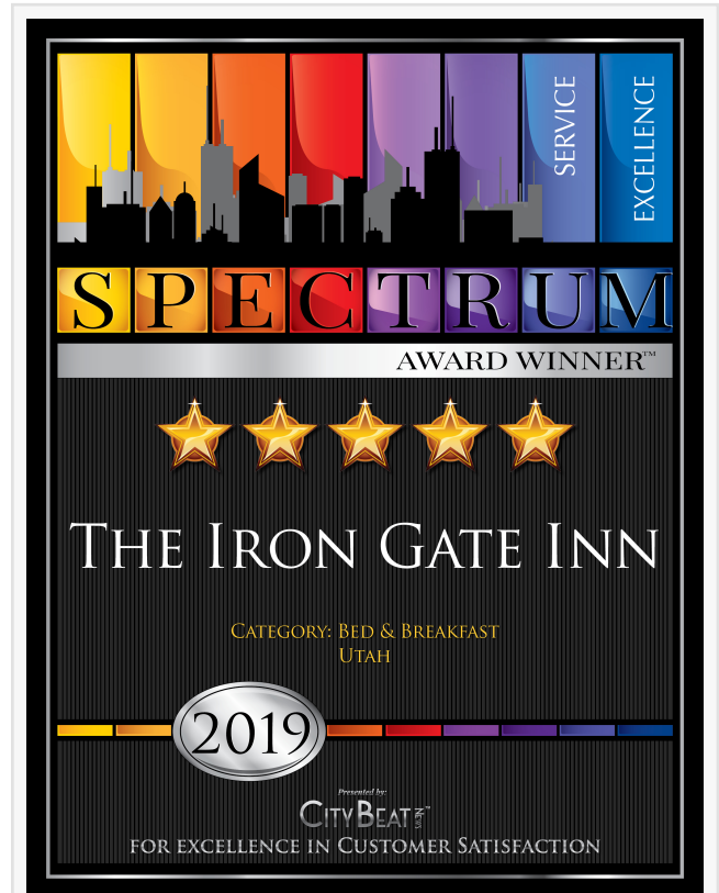
The Iron Gate Inn earns fifth Spectrum Award for Customer Satisfaction

Winners of the Spectrum Award are based on City Beat News' independent, proprietary research and evaluation system, which identifies businesses and professionals with a track record of top-flight customer service. The rating system combines data collected from nominations, online and other customer reviews, surveys, blogs, social networks, business-rating services, and other honors and accolades — all of which express the voice of the customer. Those that earn a 4-star or 5-star rating receive the Spectrum Award.