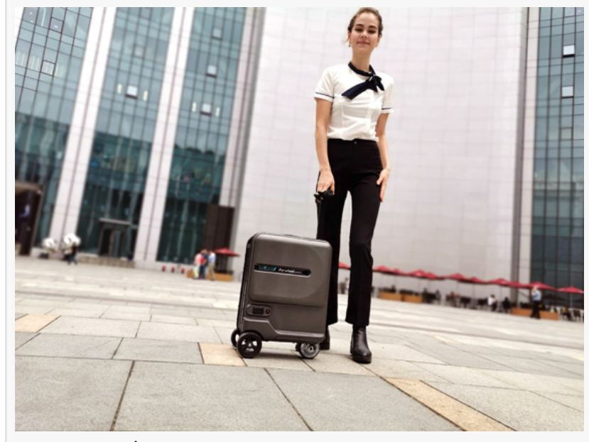
carry on suitcase

Airwheel Holding Limited Airwheel Holding Limited +32 10 61 33 24 email us here