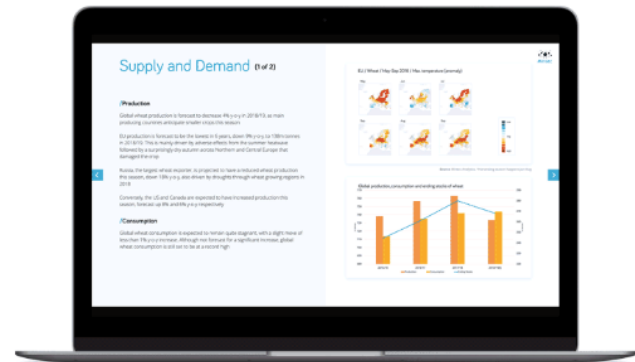
Supply and Demand

This press release can be viewed online at: http://www.einpresswire.com