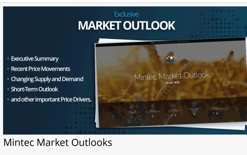
Mintec Market Outlooks

/EINPresswire.com/ -- Each Mintec Market Outlook reviews a specific commodity market by taking an in-depth look at recent price movements, changing supply and demand and other price drivers. They provide a concise view of key market drivers as well as an outlook on price. As a result, customers are better able to understand the impact of market conditions on the cost of the food ingredients and packaging materials they use.