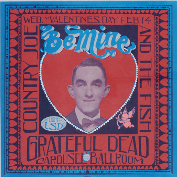
Grateful Dead poster for a Valentine's Day dance at the Carousel Ballroom in San Francisco in 1968, the finest quality CGC graded (9.8) example ever to appear in a PAE auction ($3,300).