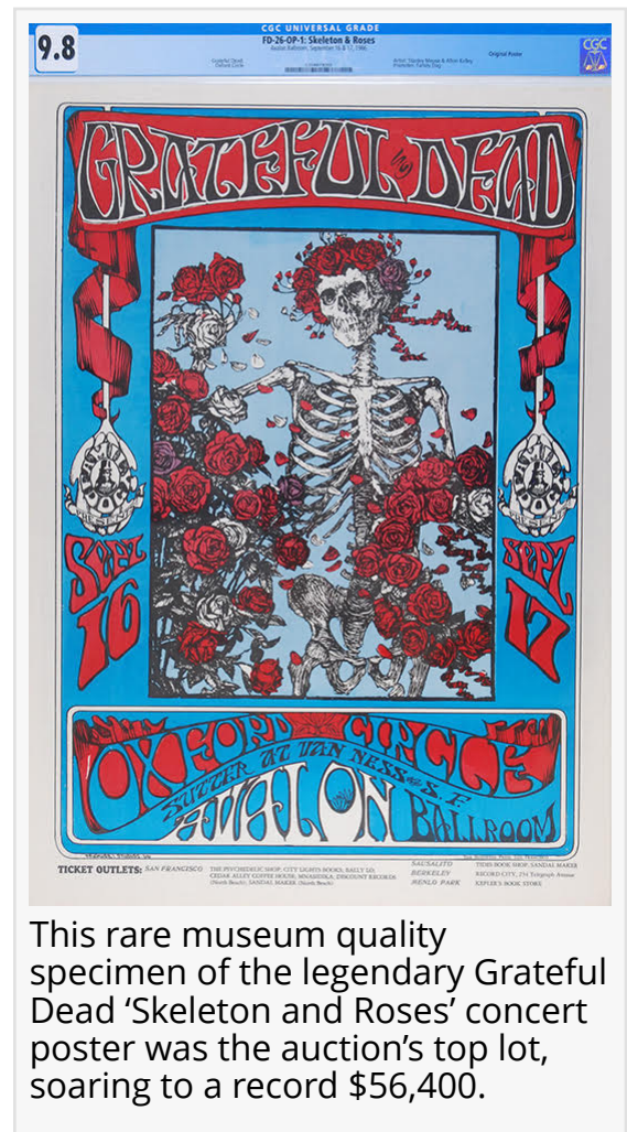
This rare museum quality specimen of the legendary Grateful Dead 'Skeleton and Roses' concert poster was the auction's top lot, soaring to a record $56,400.