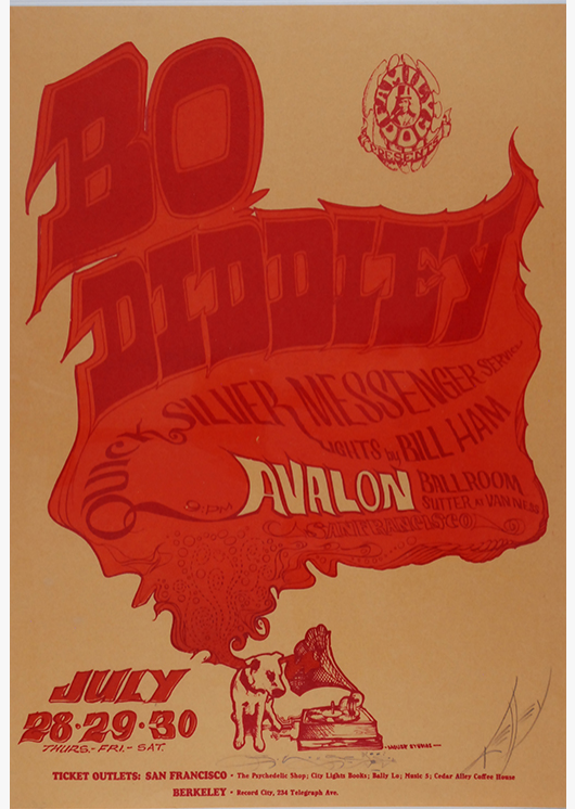
Bo Diddley concert poster for an appearance at the Avalon Ballroom in 1966, signed in pencil by artists Stanley Mouse and the late Alton Kelley, graded CGC 9.8 ($3,900).

Issue: 10/12/16 Date: 10/12/16 By: [illegible] Original Paper