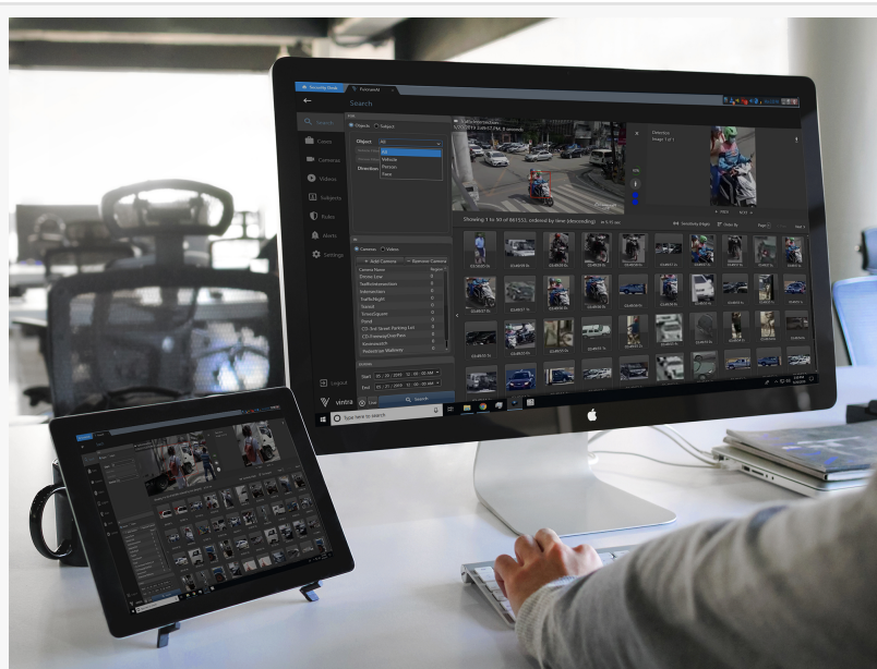
Vintra Genetec Integration Image 1

SAN JOSE, CALIFORNIA, UNITED STATES, May 22, 2019 /EINPresswire.com/ -- Vintra , an industry-leading maker of video analytics powered by machine learning and artificial intelligence, announces an integration with Genetec Inc. (Genetec), unified security, public safety, operations and business intelligence solutions. Genetec customers can now benefit from FulcrumAI, Vintra's deep learning video analytics solution integrated with Genetec™ Security Center to deliver real-time, total-environment intelligence from any camera source, fixed or mobile.