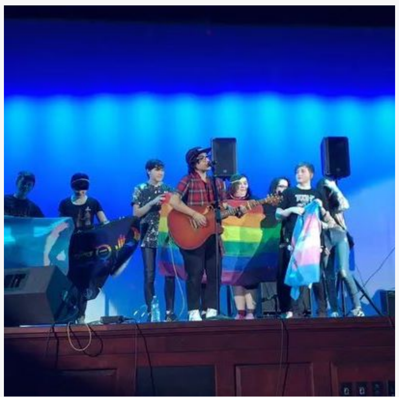
Ryan Cassata Singer Songwriter Featured on Findit

This press release can be viewed online at: http://www.einpresswire.com