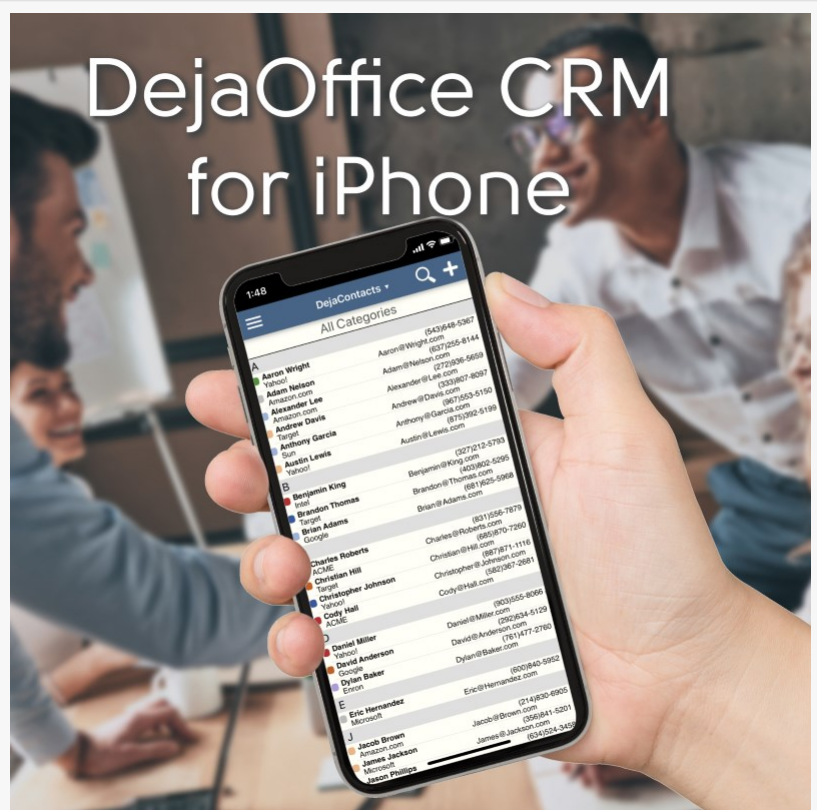
DejaOffice CRM for iPhone with Outlook Sync using CompanionLink