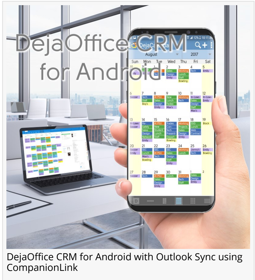
DejaOffice CRM for Android with Outlook Sync using CompanionLink