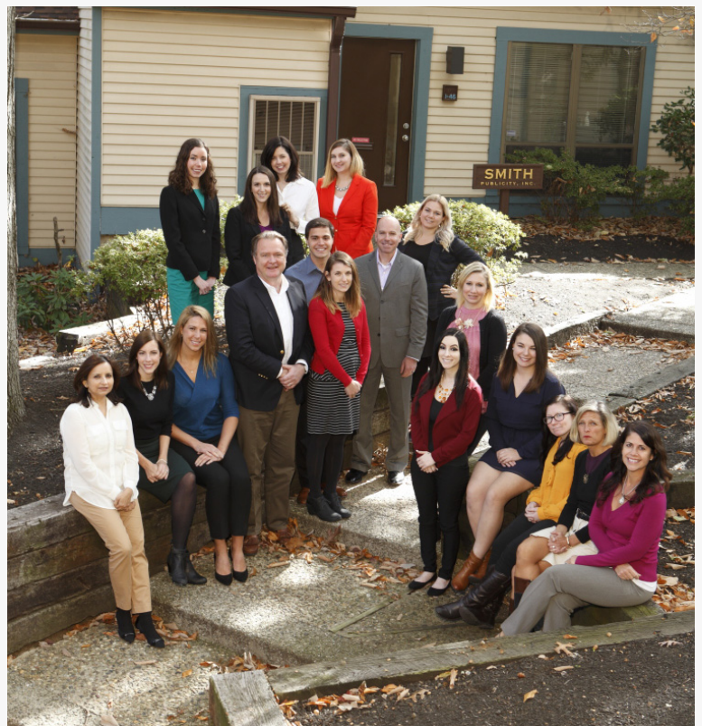
Cherry Hill, NJ office staff

This press release can be viewed online at: http://www.einpresswire.com