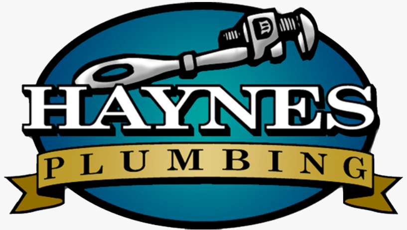
Haynes Plumbing Services Logo

After 25 years in the plumbing business, the experts at Haynes Plumbing Services know that durable, leak-proof PEX connections can't be done without properly calibrated tools. Any error in